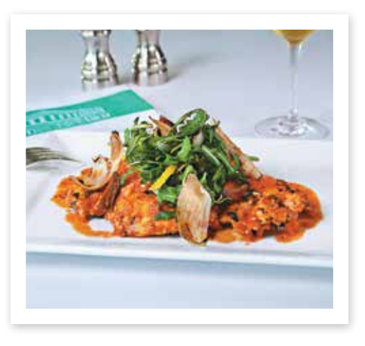
Chicken Paillard Marinated chicken breast, poached and grilled Vidalia onion, preserved lemon and garlic chips