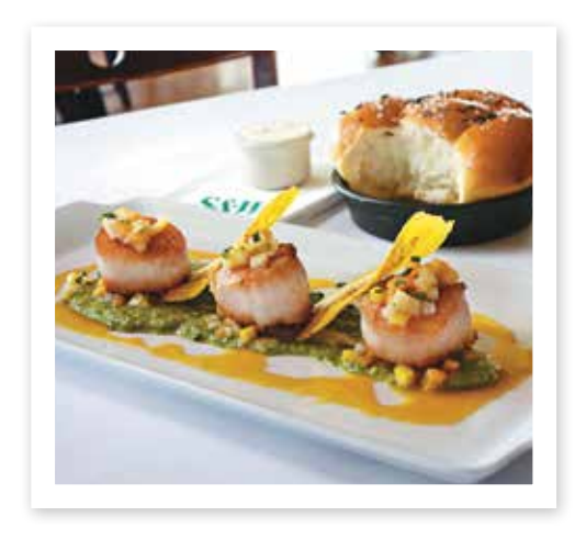
Seared Scallops Jalapeño peppers, fruit salsa and crispy plantain