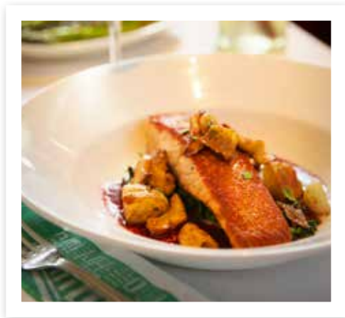
Pan Seared Salmon garlic kale, foraged mushrooms, cipollini onions, beurre rouge