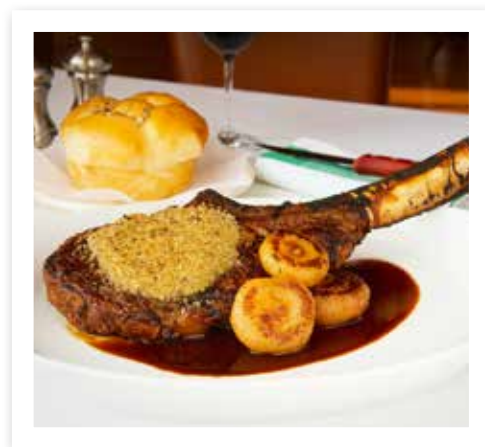
Long Bone Rib Eye bone marrow butter crusted, madeira demi glace