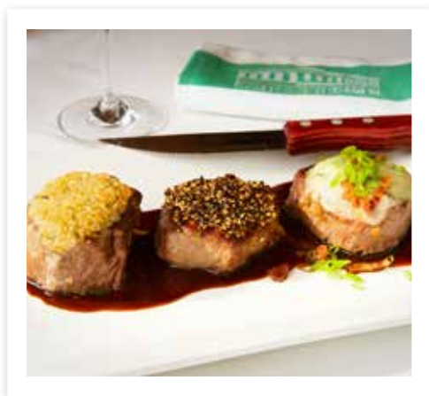
Crusted Beef Tenderloin Trio gorgonzola, bone marrow butter, au poivre