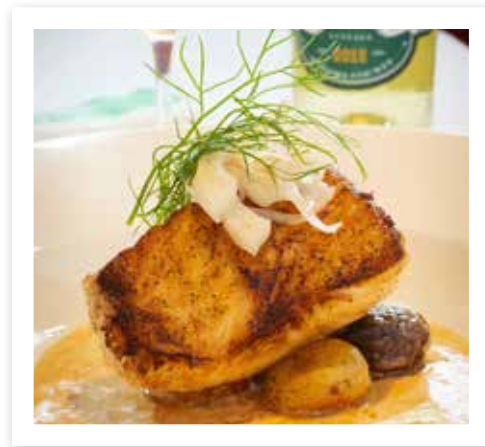
Pan Seared Sea Bass shrimp bisque, pickled fennel